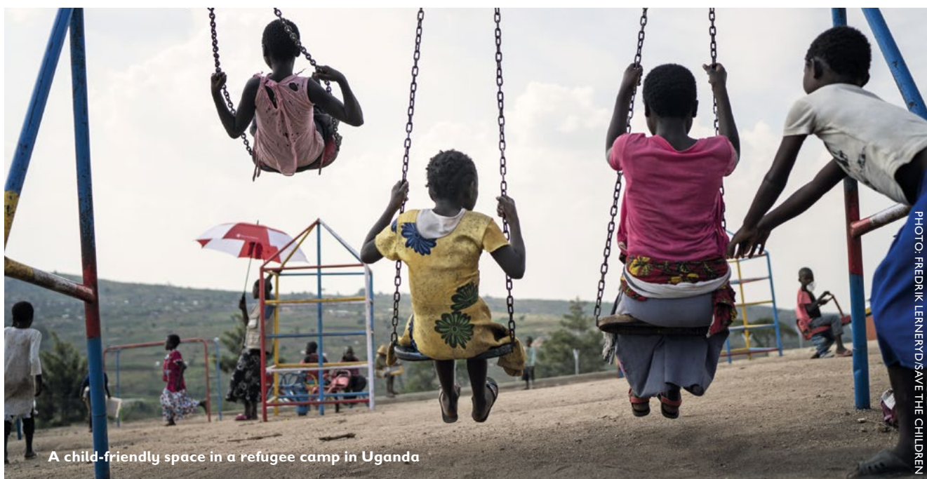
A child-friendly space in a refugee camp in Uganda

However, it is insufficient to respond only to children’s mental health. States must protect it. This will only be achieved if states and the wider international community tackle the impunity of those who perpetrate grave violations against children, uphold the norms and standards of conflict on the ground. As set out in the Stop the War on Children report, 34 states can take action in a number of ways. Governments should use the opportunity of the UN General Assembly in 2019 to set out how they are fulfilling their obligations to children, and how they will make progress against the following measures.